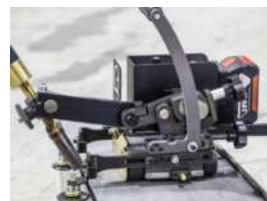
Corner outer welding with drive wheels on the horizontal plate of the workpiece.

Horizontal plate acts as a guide. this case occurs when the horizontal plate is narrow.