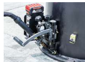
Corner outer welding with drive wheels on the circular wall of the workpiece.

Vertical plate acts as a guide. It is necessary SPT-ANG kit.