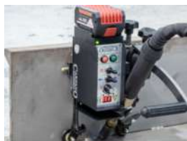
Corner outer welding with drive wheels on the vertical plate of the workpiece.

Horizontal plate acts as a guide. this case occurs when the horizontal plate is narrow.