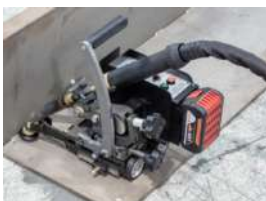
Corner inner welding with drive wheels on the horizontal plate of the workpiece.